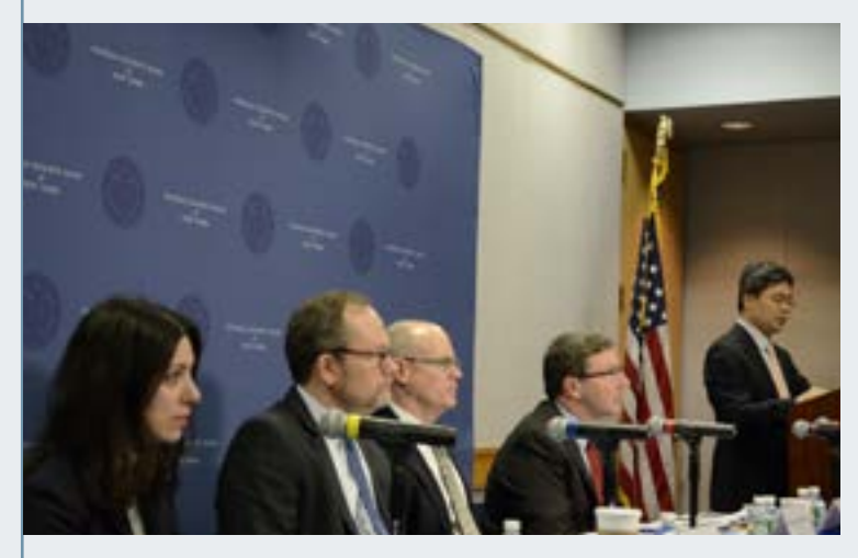
Press Briefing on Student Loan Borrowing Trends, 2015

policy through regular briefings ahead of each FOMC meeting. They monitor and analyze current economic and financial conditions; provide forecasts for the U.S. economy using judgmental as well as statistical methodologies, including the Bank's own DSGE model and a new nowcasting platform; and assess risks to the outlook. In recent work, Function economists have assessed the health of the labor market after the